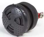
Floyd Bell Turbo Series Alarm